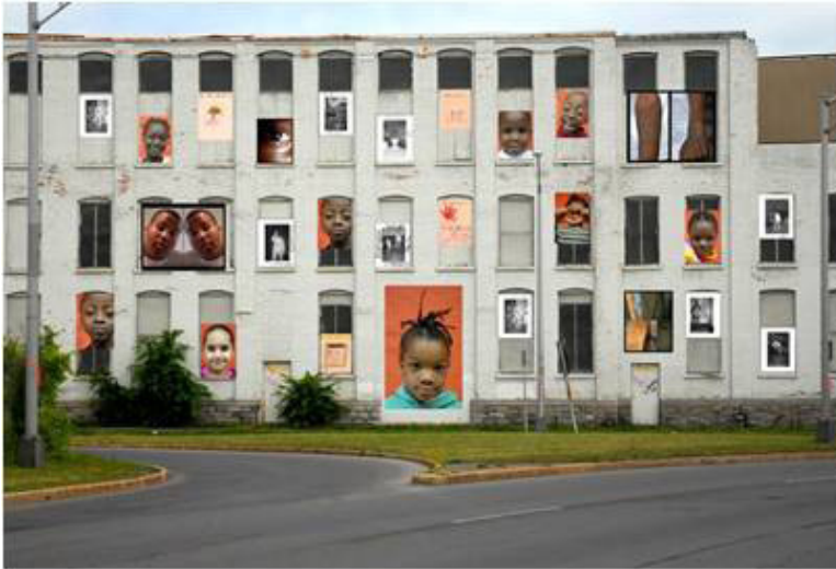
Figure 5. Photo portraits created by schoolchildren of Syracuse's Near Westside signal change in the making, covering one side of the long-vacant Case Supply Warehouse, which the nonprofit Near Westside Initiative is renovating to house regional public television station WCNY and ProLiteracy, the world's largest literacy organization, which is based in Syracuse.

literacy organization, ProLiteracy International, and soon will house WCNY, the region's public television affiliate—two organizations whose missions in communications and education speak directly to the 21 st century challenge and promise of tapping the vast pool of talent in neighborhoods such as the Near Westside. Other businesses that have relocated to the neighborhood or started there since 2006 include an architecture firm, a recording studio, a coffee shop, a fitness center, and a bakery. To support continued development and growth of the 140 businesses already in the neighborhood, the Near Westside Initiative has helped organize a business association.