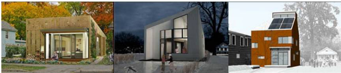
Figure 4. Renderings of the three winning designs from the international “From the Ground Up” competition conducted by Syracuse University’s UPSTATE:A Center for Design, Research, and Real Estate and the Syracuse Center of Excellence in Environmental and Energy Systems. From left to right they were designed by Cook+Fox and Terrapin Bright Green; Architectural Research Office and Della Valle Bernheimer; and Onion Flats.