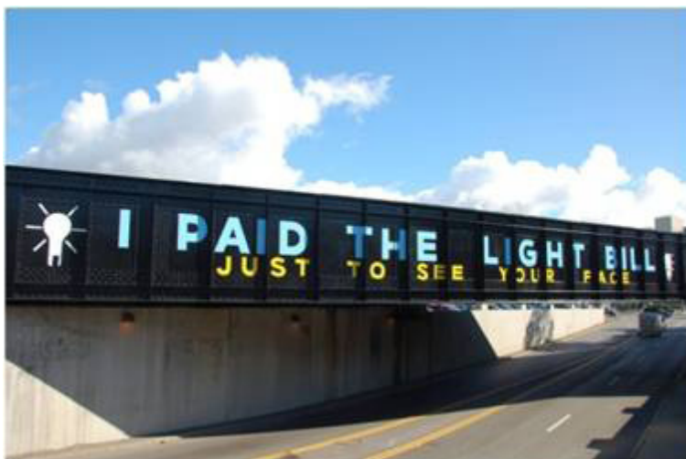
Figure 3. One of the six murals painted on old train trestles in Syracuse's Near Westside neighborhood by celebrated graffiti artist Steve Powers that have turned perceived barriers into gateways.

A Love Letter to Syracuse is meant to be from Syracuse to Syracuse. We found as we were painting it, it is also to industry, to the trains that pass over the bridges, to the act of painting hot steel in the summer, to collaboration, to polite drivers, and especially to improvisation (Powers, 2010).