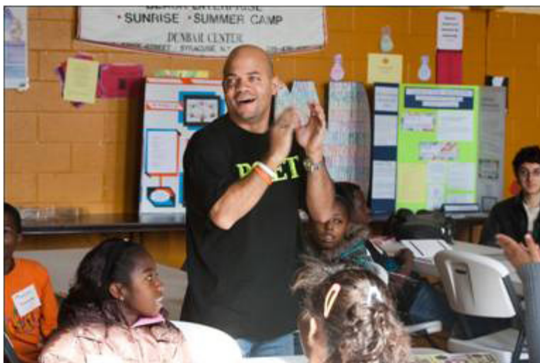
Figure 7. A member of the Syracuse University student poetry group “Verbal Blend” leads a writing exercise in an after-school program under the auspices of Say Yes to Education Syracuse, a precedent-setting, district-wide urban school reform project collaboratively conducted by Syracuse University, the Syracuse City School District, and the Say Yes to Education Foundation.

In four schools and three community locations, Say Yes to Education Syracuse is operating free legal clinics where lawyers give families pro bono advice, service, and referrals in such areas as housing, immigration, and debtor rights. Collectively, Say Yes to Education Syracuse and community partners are working to ensure that children take advantage of available medical insurance programs, enrolling 90% of the students in 18 schools, and setting up physical and mental health clinics in 20 schools.